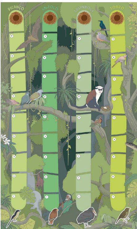
Biodiversity Game board.

Playing and learning are interlinked in this activity to help children understand the importance of conservation. Born out of a desire to ignite the spirit of conservation among the youngest population, BirdLife has developed a game dedicated to teaching in a playful way about the uniqueness of São Tomé and Príncipe's biodiversity.