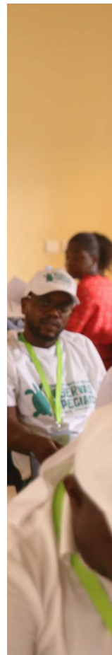
Capacity building session for members of the pilot management committee of the southern SRs management committee.