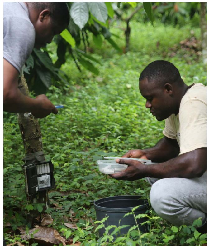
Data collection for monitoring.