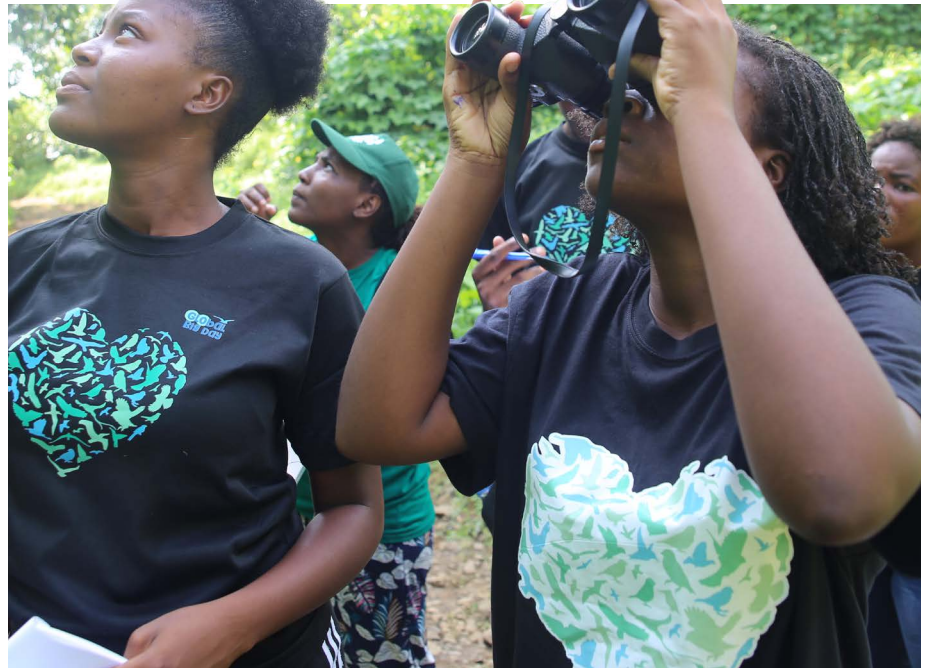
Birdwatching during October Big Day.