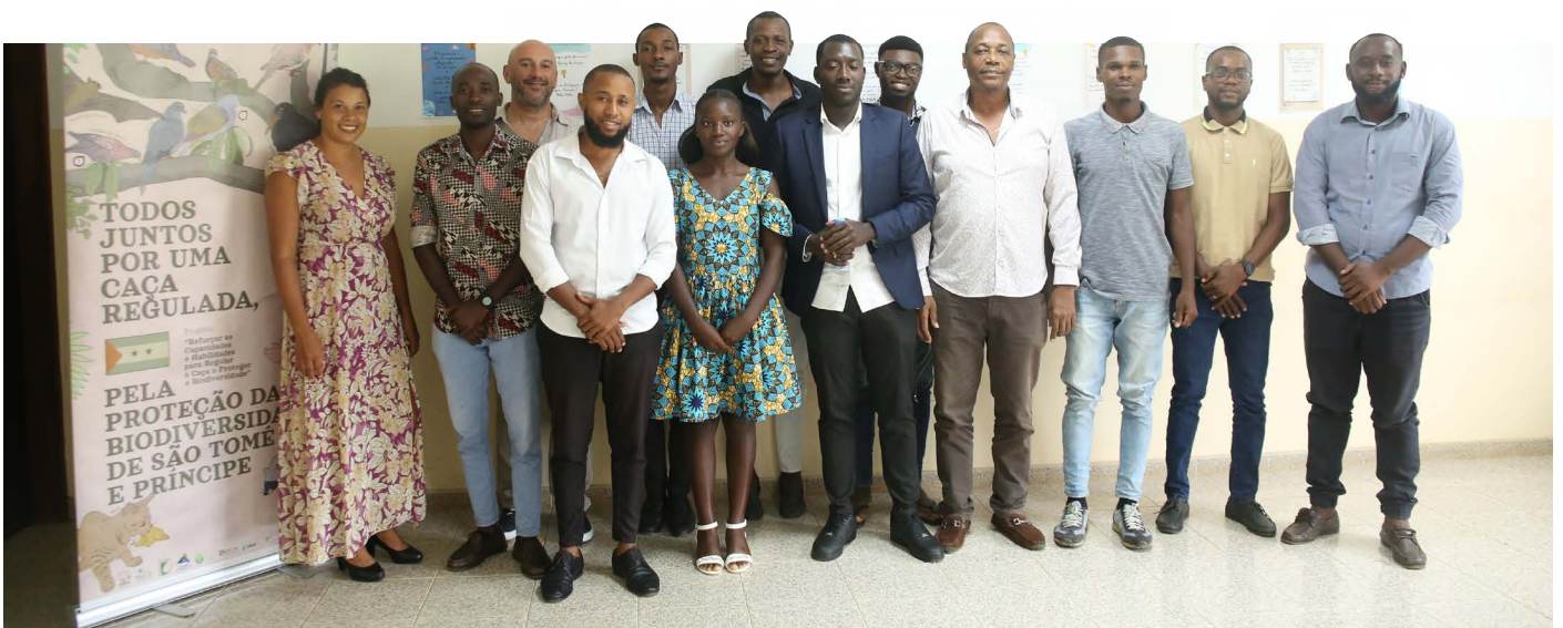
Exchange session to present the sustainable hunting project to the local media.