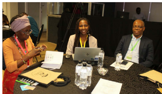
Participation in CAFÉ Net in Namibia.

At the same time, fundraising efforts are underway, presenting the fund’s progress so far to potential donors.