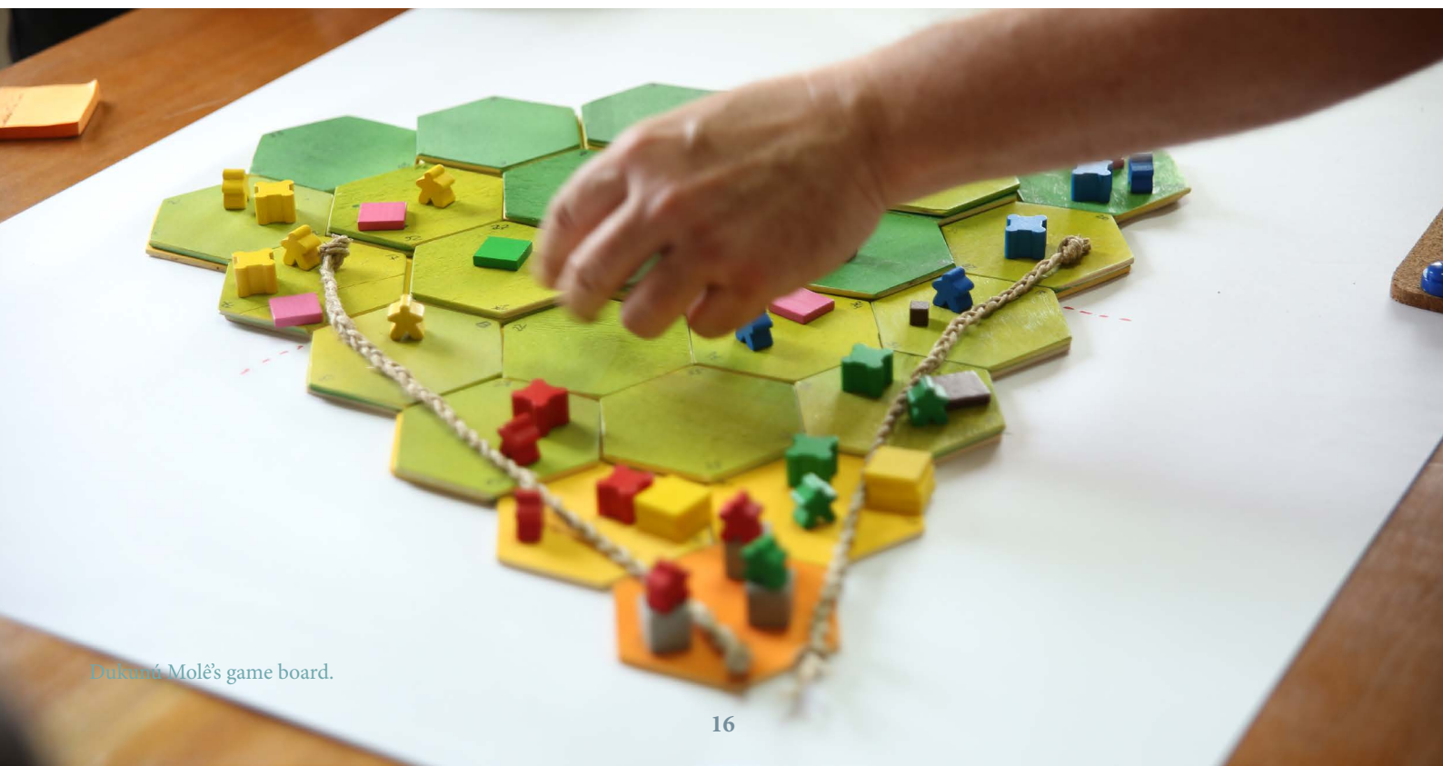
Dukunú Molê's game board.