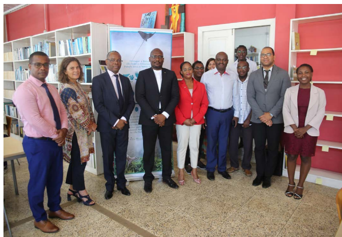
First meeting of the EcoTéla Fund inter-ministerial committee.

The EcoTéla Fund will be fully operational by 2026, with the potential to capitalise 1.5 million per year.