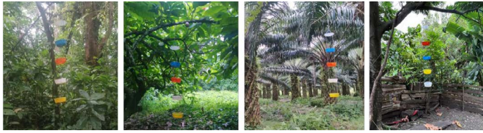
Arthropod sampling traps.