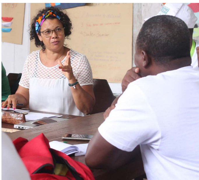
Work meeting of the pilot management committee of the southern SRs.