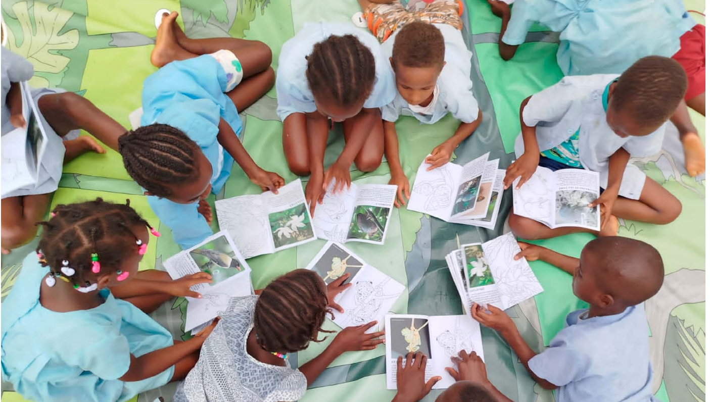
Awareness-raising session with the Biodiversity Game at Vila Malanza's Primary School.