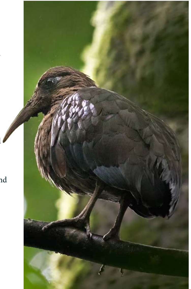
São Tomé Ibis - Bostrychia bocagei - Lars Petersson.

Hunting in STP does not have to be a threat, on the contrary, it can be a very effective activity that can help preserve the extraordinary biodiversity of the islands and thus create a more sustainable future for generations to come.