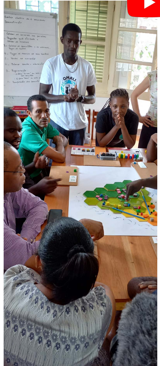
Dukunú Molê game session with representatives from local institutions.

At the same time, we developed and implemented a participatory theatre in 5 communities, in which, similarly to the game Dukunú Molê, we set challenges for the communities to identify solutions on their own. After presenting their proposed solutions, members of the public become a part of the theatre play by taking on the proposed role and presenting their solution.