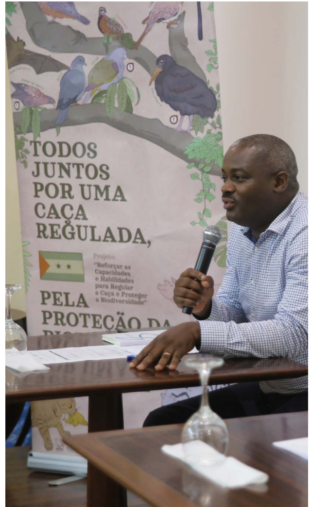
Round table to validate the proposed roadmap to update the hunting law regulations.