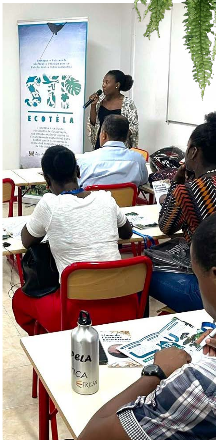
Capacity building session on sustainable finances to local institutions.

The fund will be hosted by the EcoTéla Foundation, an independent organisation with administrative structures (initially comprised of 3-5 members, including the CEO and a fundraising team) and governance structures that will ensure the technical, scientific and financial supervision of the fund, as dictated by Conservation Finance Alliance 1 . The administrative and governance teams will manage the fund by promoting the capitalisation of resources through 3 windows: endowment, revolving and sinking.