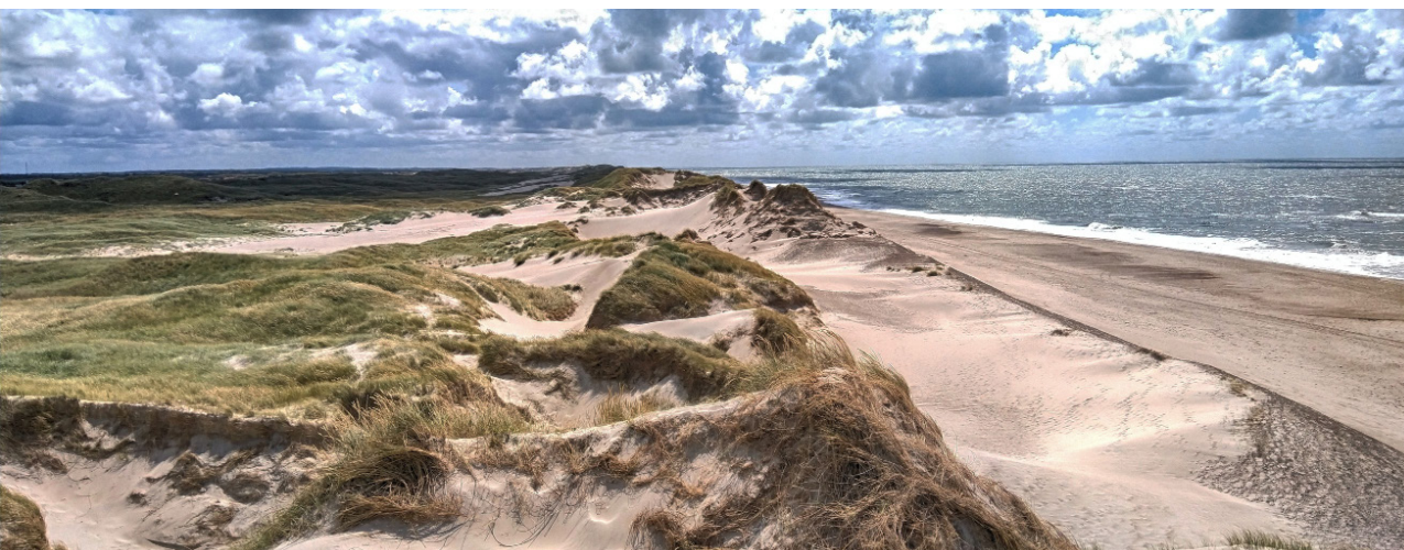
Sand dunes, Uwe Jelting / Unsplash

EXAMPLE A dune ecosystems restoration project in Sardinia 24 implemented anti-erosive, stabilising and consolidation actions for the protection and restoration of dune ecosystems through naturalistic engineering interventions. Restoration actions were performed ensuring the manual removal of invasive alien plant species and the subsequent planting of native ones, with the aim of contributing to the preservation of indigenous plant communities and their genetic diversity. The activities included different interventions (positioning of cane structures for sand retention and consequent recovery of the dune profile, positioning of coconut fibre bionets to avoid erosion, particularly after the eradication), as well as plantation and sowing of plant species.