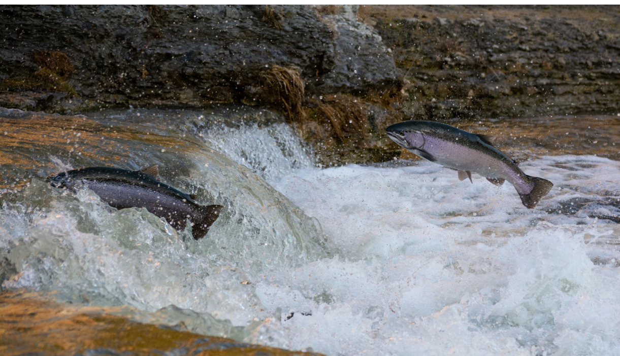
Salmons migrating

EXAMPLE To restore the connection between the Wadden Sea and Lake IJsselmeer, Netherlands, a permanent entrance will be built in the Afsluitdijk dam (“ fish migration river ”) by 2023. This should allow for the passage of different fish species, such as the Sea Trout, the River Lamprey, the European Eel, the European Flounder, and the critically endangered Atlantic Salmon.